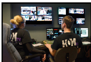
New Master Control Monitors