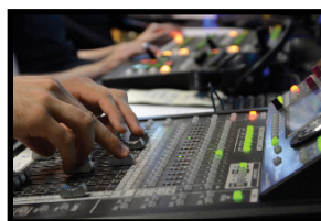
New Digital Audio Board