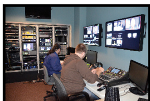
New Master Control Room